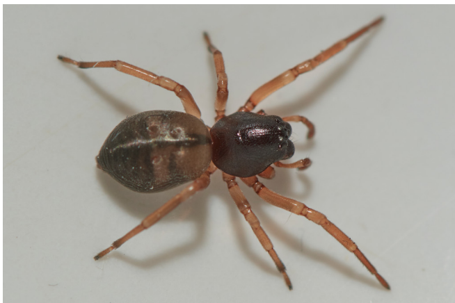
Fig. 1: Paratrachelas maculatus (Thorell, 1875) female from Vienna, Austria (both legs I missing)

Measurements. Prosoma length: 1.85 mm (♀ from Stuttgart), 1.95 mm (♀ from Vienna).